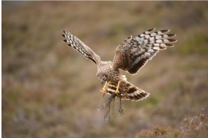
Hen harrier (Circus cyaneus) Of the UK's birds of prey, this is the most intensively persecuted. Please report any sightings to SNH.

Explore the A-Z guide to find out about licensing for a specific protected species, including how to apply for each type of license.