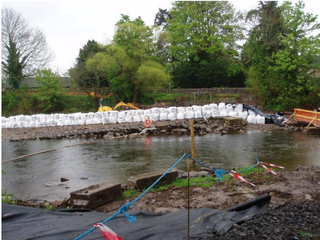
Isolating work area to prevent pollution of the main river downstream

It is usually necessary to isolate working areas during the construction of these structures. For details of measures you could take to minimise impacts, consult section 3.4 of SEPA's Good Practice Guide: Temporary Construction Methods .