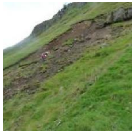
Landslip on steep ground

You should carry out a comprehensive ground investigation to characterise the ground conditions. Important information for track