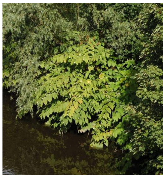
Invasive Japanese knotweed over river

Identifying a non-native species on a site early lets developers assess and cost options for managing, disposal, or destruction.