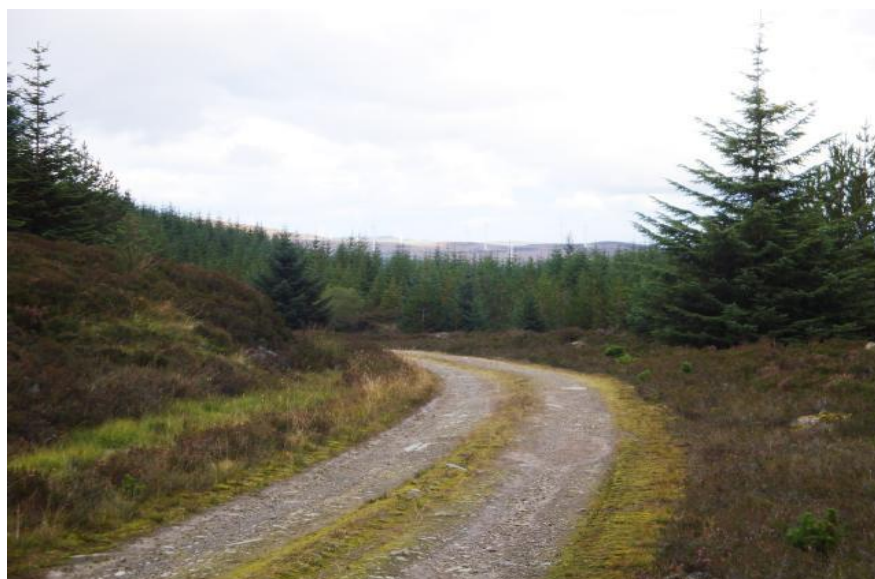
Vegetated centre line on track to soften visual impact

How the track is designed and constructed in the topography, including route, material use, width, passing place location and verge formation can help minimise the impacts of the scheme.