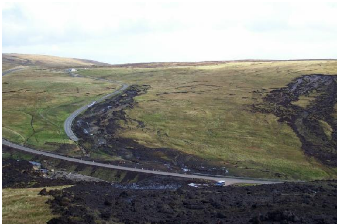
Peat slide impacting road

The Planning Authority should expect developers to demonstrate that site specific peat stability information has been properly recorded, analysed and presented. For example if a developer's site investigation/survey identifies any area of high or medium risk in relation to a potential peat landslide incident, then it is expected that the submitted information will include detailed proposals of mitigation measures that reduce those risk levels to an acceptable or manageable level.