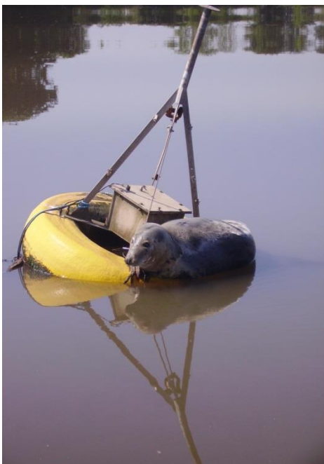
Figure.1 South Alloa monitoring Buoy.

Moderate / Poor boundary for water quality for transitional waters.